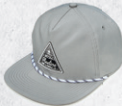
Fog w/ White / Black Stripe