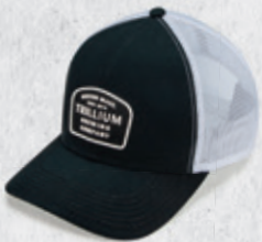
Midnight / White