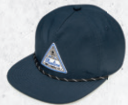
Resolution w/ Black / White Stripe