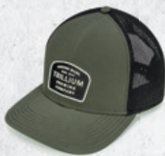
Rifle / Black