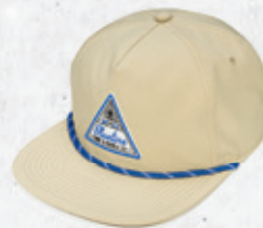
Wheat w/ Royal / White Stripe