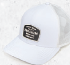
Snow / White