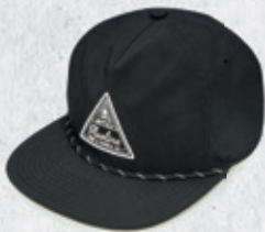
Midnight w/ Black / White Stripe