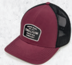
Wine / Black