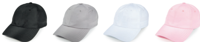
Black Available in Regular or Small Fit Steel Available in Regular Fit Only White Available in Small Fit Only Pink Available in Small Fit Only