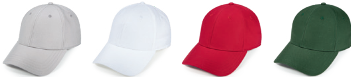
Steel White Scarlet Forest