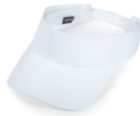
White Available in UV Lite Only