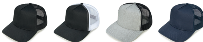
Black / Black Black / White Grey Heather / Black Navy / Navy