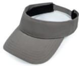
Charcoal Available in Cotton Twill Only