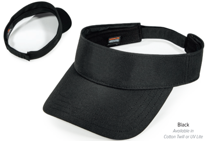
Black Available in Cotton Twill or UV Lite