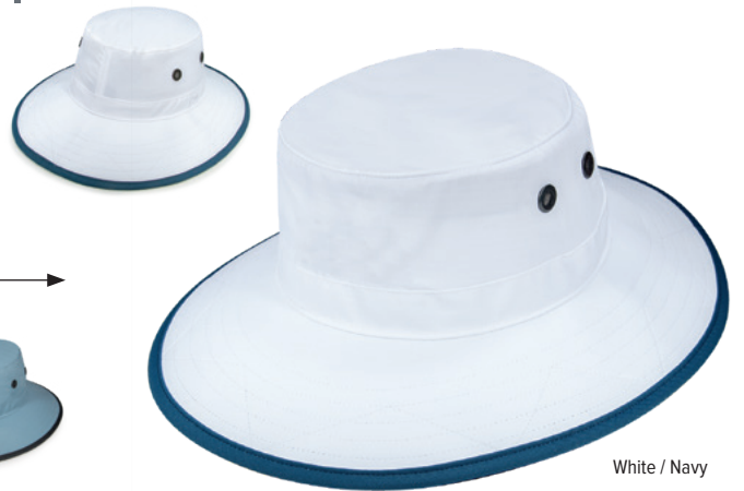
White / Navy