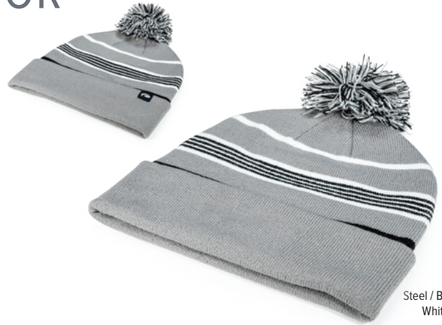
Steel / Black / White