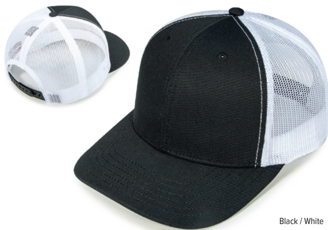
Black / White