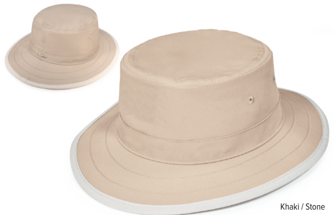
Khaki / Stone