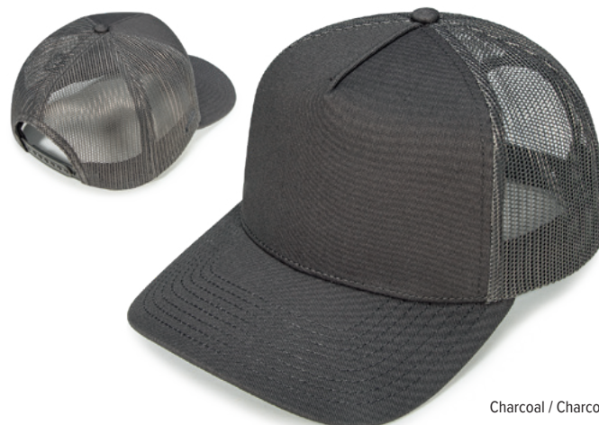
Charcoal / Charcoal