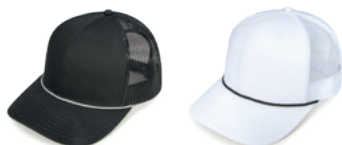
Black / Black w/ Steel White / White w/ Black