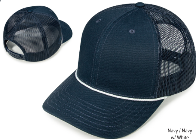
Navy / Navy w/ White