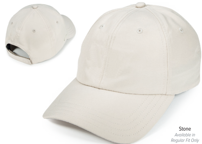
Stone Available in Regular Fit Only