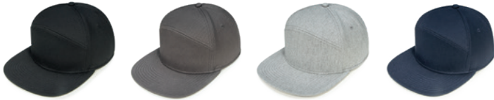
Black Charcoal Grey Heather Navy