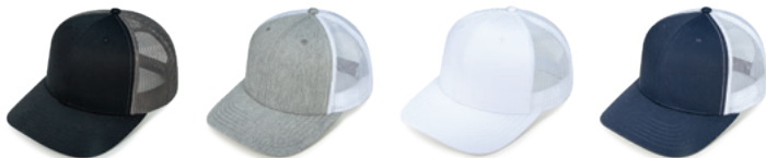
Black / Charcoal Grey Heather / White White / White Navy / White