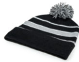
Black / Steel / White